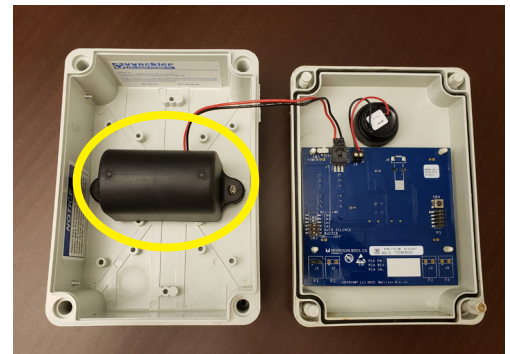
New Style Battery