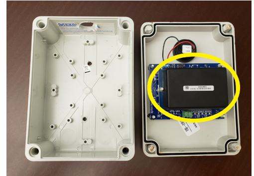
Old Style Battery

If you have any questions, please feel free to contact Morrison Bros. Co. customer service at (800) 553-4840 or custserv@morbros.com.